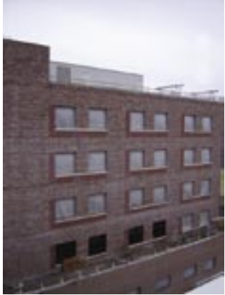
Completed masonry/window installation on the east face of the new patient floors.

Significant progress has been made on the expansion at St. John Hospital and Medical Center, bringing the opening of the first phase of the Van Elslander Pavilion in September into closer view.