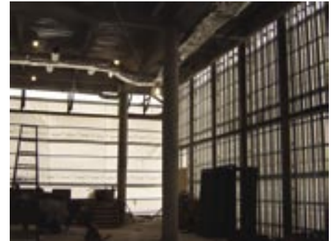
A view of the first floor atrium area, looking northeast. Windows and a revolving door will be installed on the north face; masonry will be installed on the east face.

On the Van Elslander Pavilion, exterior brickwork is nearing completion, and installation of the new entrance canopy is starting. In addition, much work is taking place inside, including installation of drywall, ceilings and floors, paintwork, plumbing, ductwork and fire protection systems.